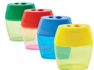
(1 manual pencil sharpener)