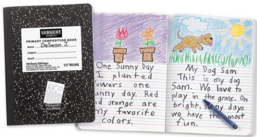
primary notebook with picture box)